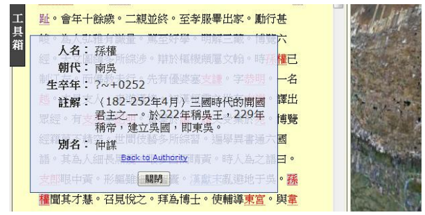
Figure 4: Pop-up information from the Authority Databases

A) An interface to read the biographies with on-click information on names and dates, which is retrieved dynamically from the Authority Databases (Figure 4).