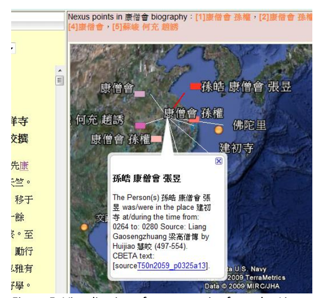
Figure 5: Visualization of a nexus point from the Liang Gaoseng Zhuan

B) More complex queries can be made from the search dialog interface. It is here that the potential to extract information from the texts is significantly expanded, as researchers can download KML files that visualize answers to questions which could not even be asked of traditional reference tools, such as indices or comparative calendars. Users select one or more persons and places and specify a time period, and receive answers to their queries in form of a