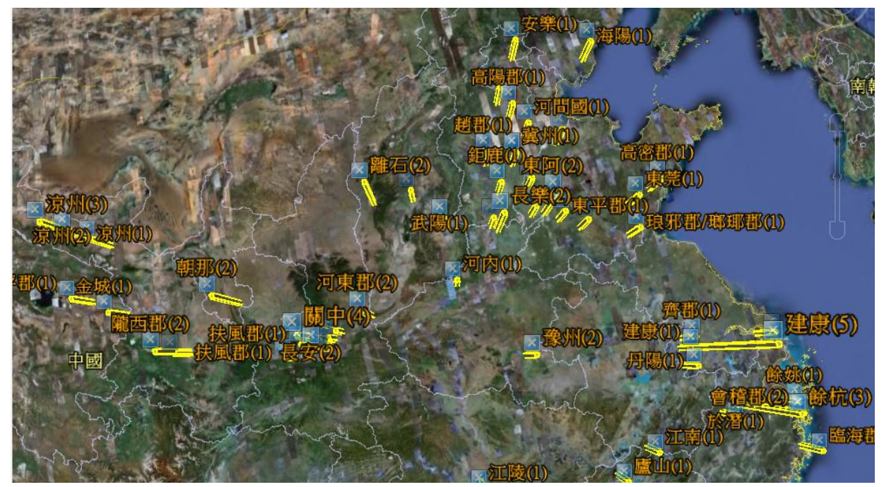
Figure 7: Visual representation of the birthplaces of monks from 60 to 500CE, as recorded in the Liang Gaoseng Zhuan . The heights of the bars represent the number of monks born in a given location.

of China, Figure 7, above, reminds us that the majority of monks born between 60 and 500 CE came from the north of the country.